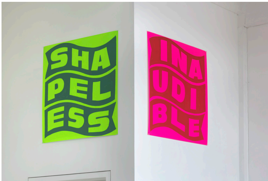
Enigmatic State 2, 3, 2021, enamel on Day-glo paper