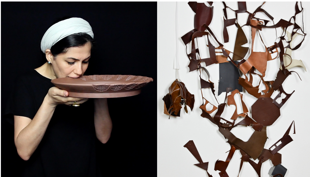
Raheleh Filsoofi, Bite , 2021, ceramic objects and performance Cameron Downey, Otherwise , 2021, leather and audio, 3 x 6 ft

Friday, December 10, 2021 - Saturday, January 22, 2022