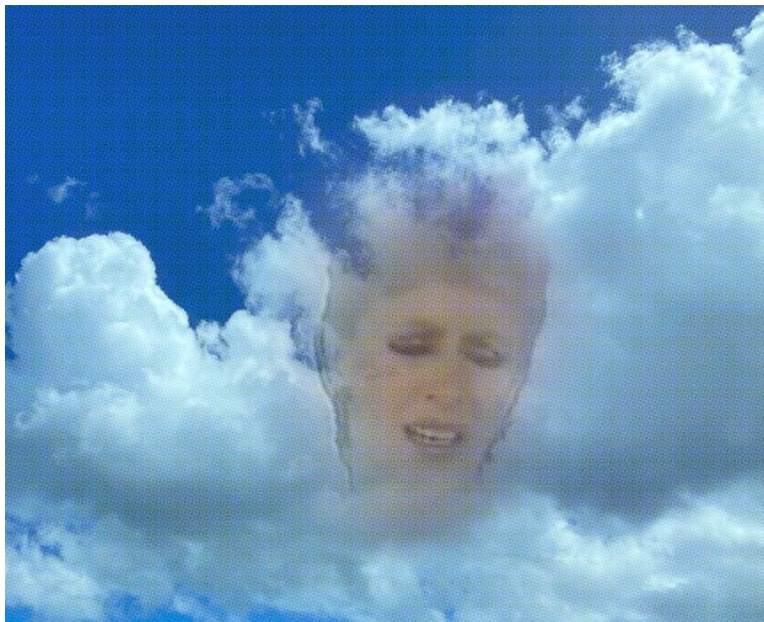
La Distancia | The Distance , 2022, photo composition digitally produced on archival paper

Saturday, October 29 - Friday, December 9, 2022