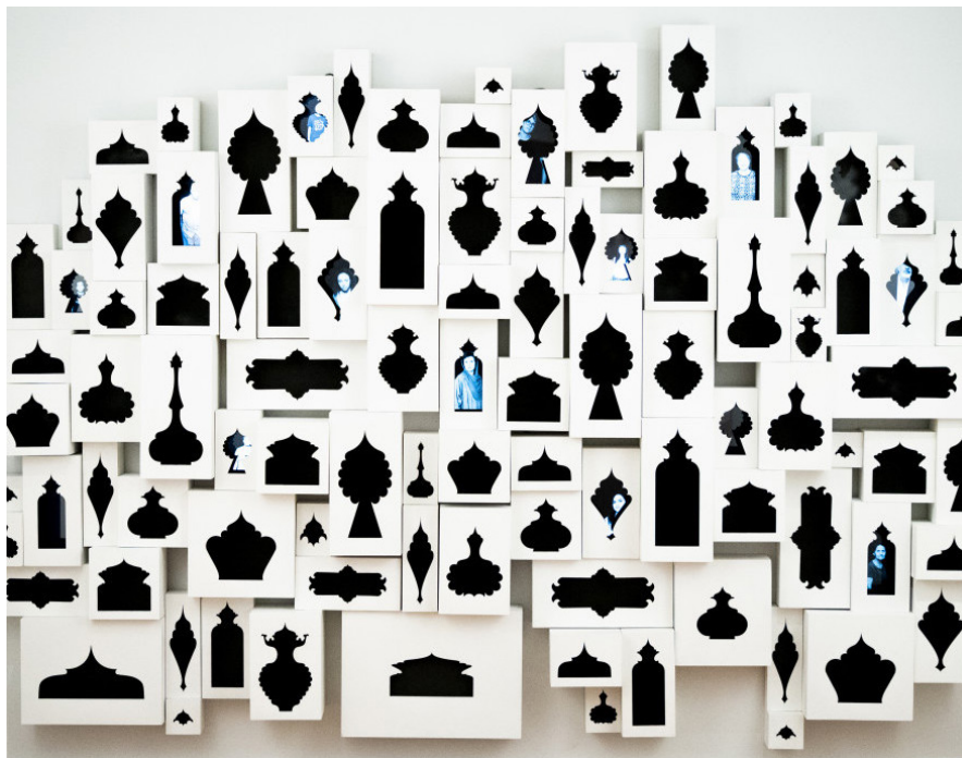
Imagined Boundaries , completed in 2017, multimedia installation

Saturday, September 10 - Saturday, October 15, 2022